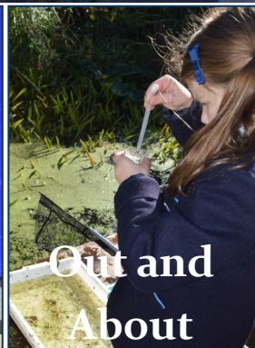
Out and About